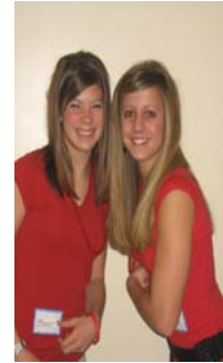
Doing a STAR event makes every student a Super STAR!!!

Challenges make you discover things about yourself that you never really knew. They're what makes the instrument stretch—what make you go beyond the norm. (Tyson)