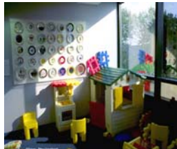
The FACS classroom offers many opportunities to introduce STAR events.